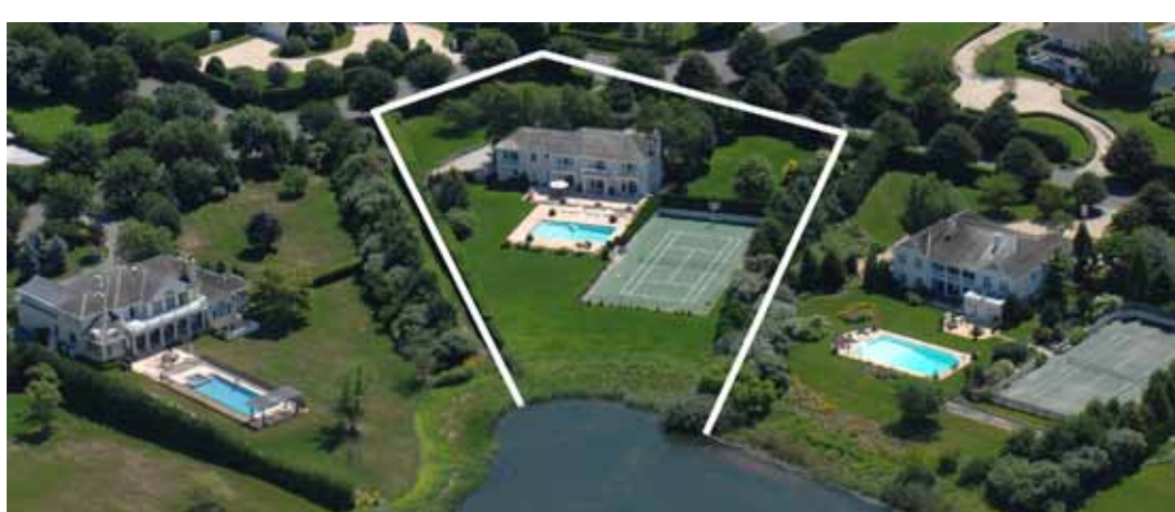
WATERFRONT VILLAGE VILA • Southampton • $4,295,000 • Newly renovated, within a prime Village location this 2-story Mediterranean Villa offers exquisite water views. Enjoy a match of tennis on your personal court or swim laps in the heated gunite pool. Includes 6 bedrooms, 6.5 baths, open kitchen and dining, living room with fireplace, finished basement, and 2-car garage, all surrounded by mature hedges, plush landscaping and sweeping pond views. Only minutes away from ocean beaches and Village shopping and dining. Exclusive. #53991. Enzo Morabito TEAM, EVP

THE NEW ELLIMAN.COM THE ONLY REAL ESTATE SEARCH DESIGNED WITH YOU IN MIND