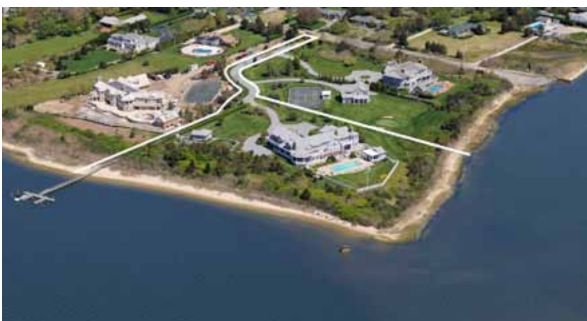
WATERFRONT ON PHILLIP'S POINT • East Quogue • $9,999,000 • Exceptional custom built Traditional set on 4.3 bay front acres. Includes a heated gunite pool with spa, pool house, boat house, dock, 3-car garage and room for tennis. The home features 10 bedrooms, 9 baths, living room, family room, formal dining room, chef's kitchen, sunroom, elevator, 4 fireplaces, wine cellar, entertainment room, theater and more. Exclusive. #39978. Enzo Morabito TEAM, EVP