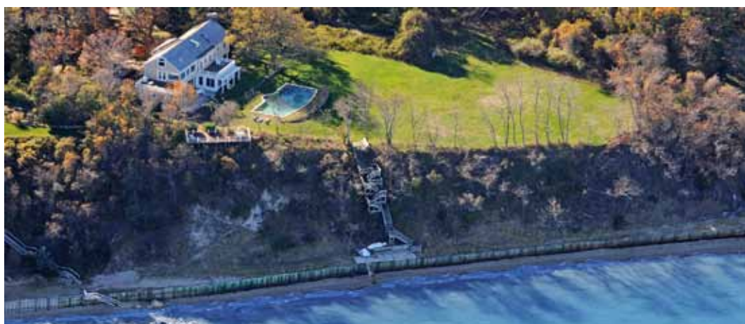
HISTORIC WATERFRONT ESTATE • Hampton Bays • $4,500,000 • One of the largest waterfront parcels on the sought-after "Gold Coast" of Hampton Bays, the Baker Estate sits on 4.2 acres with 300' of shoreline overlooking Peconic Bay. Built in 1935 for the founder of Manhattan's celebrated "21" Club, this restored 4,800 sq. ft. home has 7 bedrooms and 6.5 baths with unparalleled water views, new chef's kitchen with Viking appliances, finished basement, heated gunite pool, separate guest cottage, and so much more. Also available for rent. Exclusive. #34283. Enzo Morabito TEAM, EVP