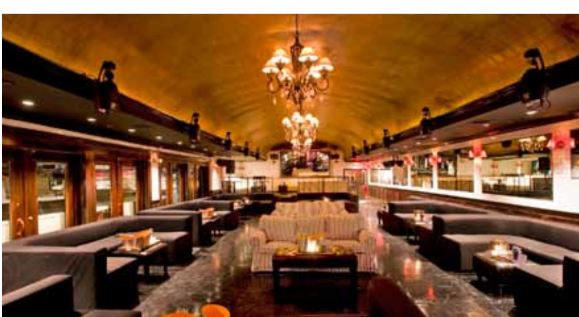
COMMERCIAL PROPERTY • East Hampton • $4,500,000 • A great investment opportunity to own a 5,000 sq. ft. building celebrated as one of the Hamptons most popular sites. The ideal setting for a bank, office, retail, pharmacy, etc. Currently, it's operated as a 100-seat high-end restaurant with a separate club and lounge. There's outdoor dining, ample parking and possibility for expansion. Zoned Neighborhood Business. Exclusive. #45138. Enzo Morabito TEAM, EVP