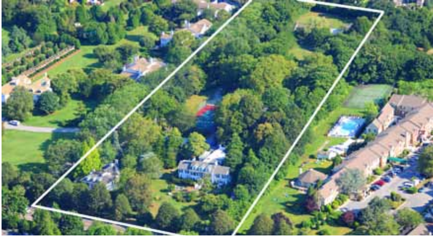
THE VILLAGE LATCH INN • Southampton • $24,750,000 • Proud to offer the historic 37-room Hotel, known for hosting Manhattan's high society since the turn of the 20th Century. On 5 acres the Village property offers a treasure trove of opportunities including a condo development, resort, spa, family compound, etc. Features 5 separate structures, heated pool, tennis court, Victorian greenhouse and park-like grounds. Exclusive. #70606. Enzo Morabito TEAM, EVP