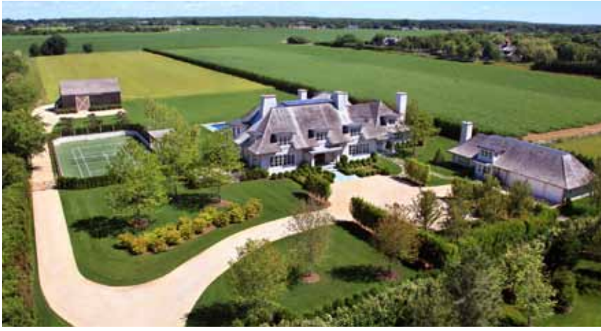
A MICHAEL DAVIS ESTATE • Sagaponack • $24,950,000 • Set on 7.5 acres, this property captures the very essence of Sagaponack - private and tranquil with forever views of open farmland. The 8-bedroom manor is gracious and comfortably scaled. Includes a 250 year old restored barn, carriage house, pool house, tennis court, and 60' gunite pool. Incorporates state-of-the-art green technology. Access by horse trail to the ocean beach. #53979. Enzo Morabito TEAM, EVP