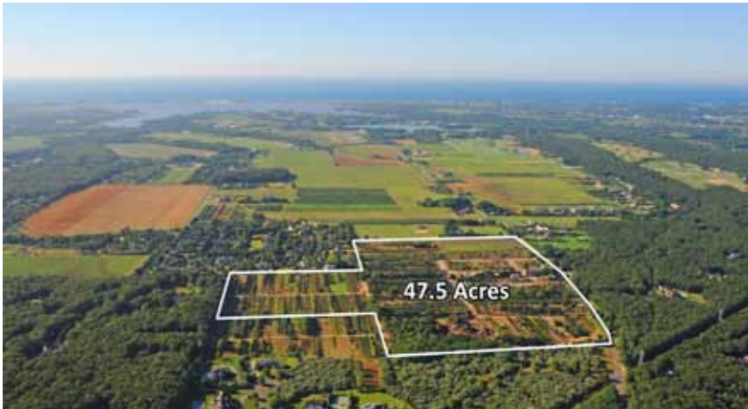
SUBDIVISION INK ALMOST DRY • Water Mill • $10,500,000 • Opportunities abound for this 47.5 acre parcel which includes 7.5 acres of residential property (for 6 separate 1-acre lots), an existing single-and-separate farmhouse, and 40 acres of reserve - perfect for polo field, horse farm, high-end development, or Hamptons dream estate. Bucolic field views and ocean vistas complete the package. 115' above sea level. Exclusive. #06266. Enzo Morabito TEAM, EVP